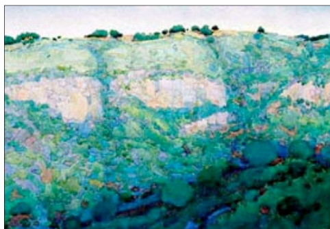
"Blackhawk Ridge Spring" by Robin Purcell

Robin Purcell's painting "Blackhawk Ridge Spring" was accepted into the "Local Voice" Show at the Bedford Gallery, 1601 N Civic, Walnut Creek, CA. The show opens Sept. 14 and runs thru Nov. 13. Call the gallery at (925) 295-1417 for hours.