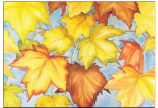
"Falling Leaves" by Lynden Aulani Tripp

"Falling Leaves" Fall seasonal watercolor painting by Lynden Aulani Tripp , currently offered as 5" x 7" note cards with envelopes by Courage Cards and Gifts. Your purchase helps people with disabilities live more independently. For information or to order contact: www.courage-cards.org or call (800) 992-6872.