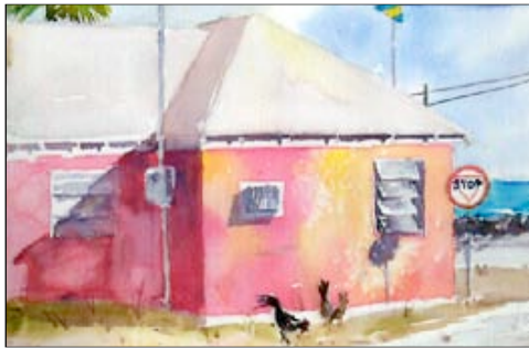
"Pink House" by Beth Bourland

CWA member Beth Bourland of Alameda recently traveled to Eleuthera, a remote island of The Bahamas, for a vacation that included lots of plein air watercolor painting and sketching. Eleuthera is a casual, somewhat rustic island of small towns and villages with friendly people, colorfully painted homes and cottages, old buildings, weather-worn boats plunked along the shoreline, pitted limestone walls, and historical churches.