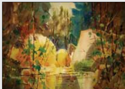
Chris Van Winkle Watercolor Unbound 5 Days/August 17-21