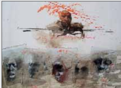
Alex Powers Design and Personal Style with Models 5 Days/September 14-18