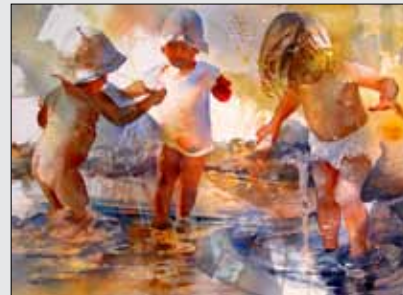
Judy Greenberg Surfaces, Textures, and Paint Quality 5 Days/October 19-23