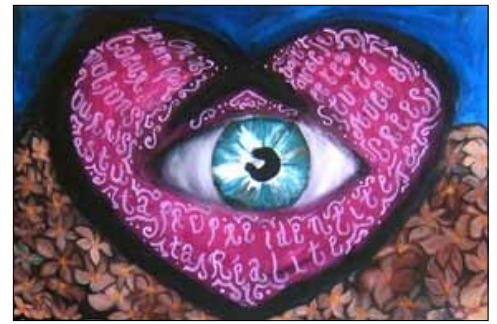
Chloe Trujillo, "Identie"