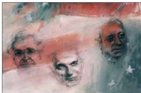
Painting by Alex Powers