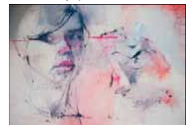
Painting by Alex Powers