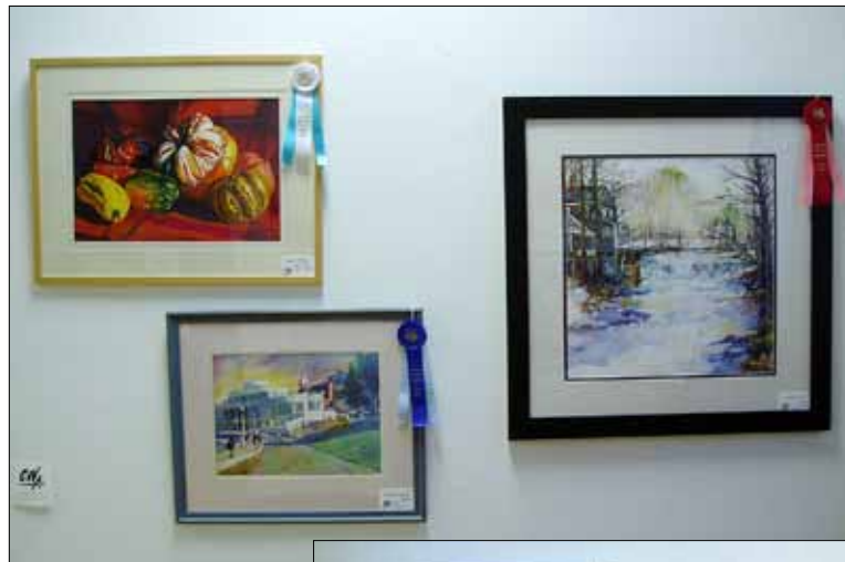
Top: First, Second and Third place winners. Bottom: Honorable Mentions.