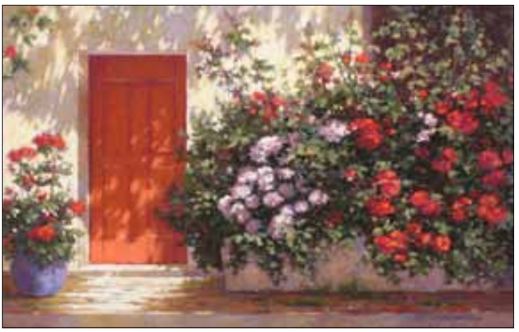
"Curb Appeal" by Claire Verbiest, KA, PSA, NWS

straightforward watercolor painting with an emphasis on texture through the use of granulating paints and a mouth atomizer, but also to rescue unsuccessful watercolor paintings with pastel and to underpaint sanded pastel paper with watercolor and pastel pigments in a powder form. Demos and critiques included. Open to all levels of painters. Price is $395 for four days before July 1, $450 after. Easel required for pastel painting. Class size is limited, so register early. Call (925) 639-7161 for more information or email pam.howett@sbcglobal.net.