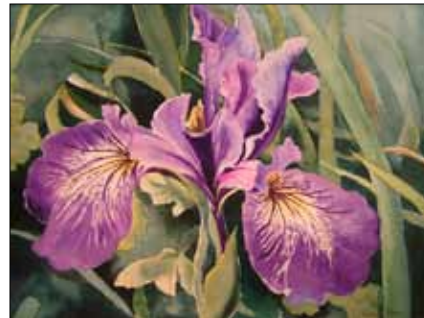
Above: "Iris," at right: "Cats"

I completed the Masters Class for teaching Point Zero (a meditation practice with paint) in 2006. Point Zero has taught me to create without limits. When I compromise I experience creative blocks. By letting go of conditioning I allow energy to flow through me in a less encumbered way with natural ease. I also teach Plein Air Sketching and Painting at Blake Gardens in Kensington through ASUC.