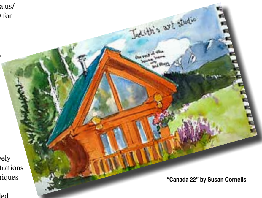
"Canada 22" by Susan Cornelis

Fallbrook School of the Arts has just published its lecture and demo schedule for 2010. A large selection of lectures and demos are free, register as soon as possible as space is limited. Fallbrook also offers a large variety of classes for adults and children (not free). Their fall schedule has just been published as well. Visit them at www.fallbrookschoolofthearts.org/ for more info and to see what tickles your fancy.