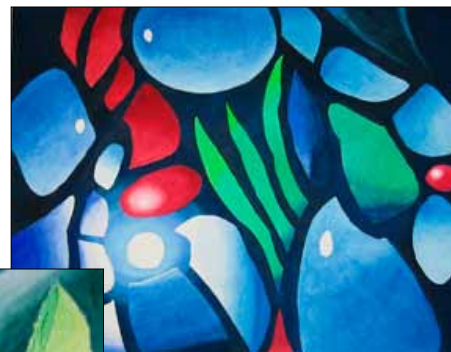
Above, "Abstract 021"

My work is very influenced by Japanese art, especially Manga and Anime. I like to paint things that make people wonder, things that I want to have, fantasy places where I want to be, fantasy creatures whom I want to meet. And also I like to paint cats too.