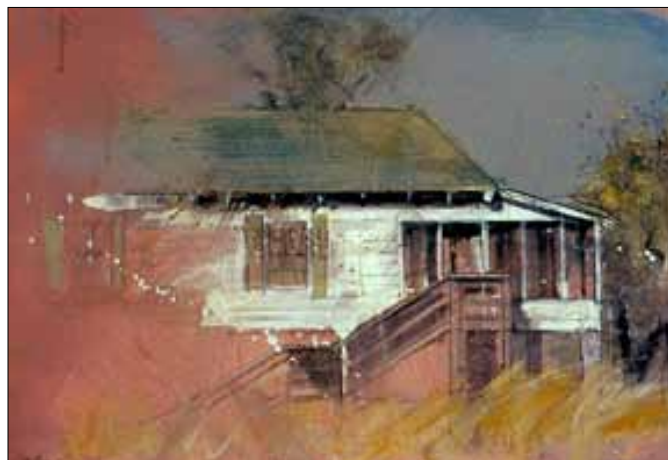
“Abandoned Creek House”