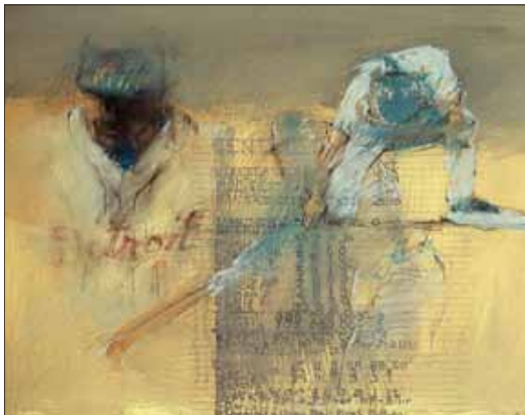
“Not a Good Year”

To receive this newsletter electronically (and in color) please send a note to our Data Manager with the email address at which you wish to receive the newsletter. You will then no longer receive it on paper in the mail, but will receive it via email.