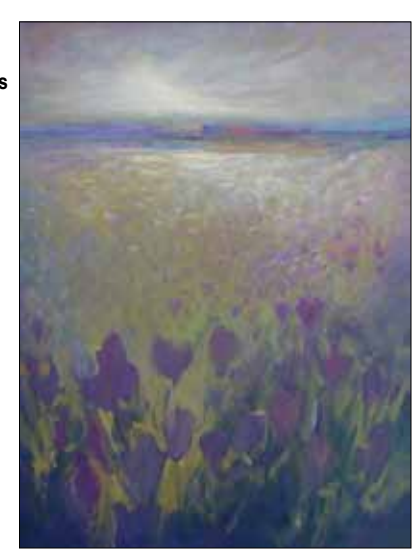
"New Day" by Kay Athos