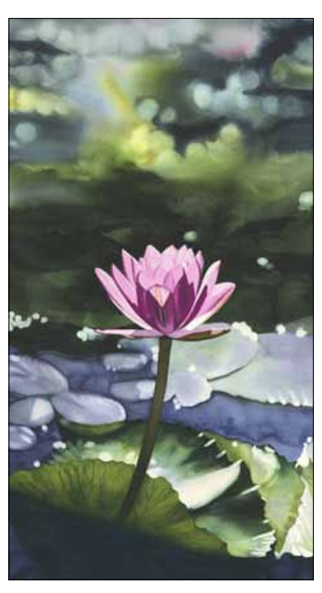
"Water Lilies" by Kathleen Alexander

Kathleen Alexander, WW, NWWS, is holding three watercolor workshops as well as weekly classes this fall. Weekly classes are from September 30-November 25, from 10 am - 12:30 pm and an evening session from 6:30 - 9 pm. Workshop#1: Painting Flowers, October 23, 24, 25, Workshop #2: Painting Flowers & Glass, November 13, 14, 15, Workshop #3: Painting Waterlilies & Lilyponds, December 4, 5, 6. The classes will be held in Pacifica. For more information, visit www.KathleenAlexanderWatercolors.com or call Kathleen at (650)355-6362.