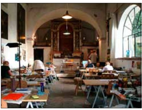
La Romita School of Art

Painting and Drawing in Umbria with Vesta Kirby, May 6 - 20, 2010. Journey to La Romita School of Art, established 40 years ago in a beautifully restored 16th century monastery located in the Umbrian hills between Rome and Florence. Umbrian chefs prepare our meals and pack lunches for daily excursions. Accommodations feature rustic, restored bedrooms with modern bathrooms at each end of the hall. Daily watercolor instruction given. Transportation is provided to all sites, Assisi & Perugia, including airport