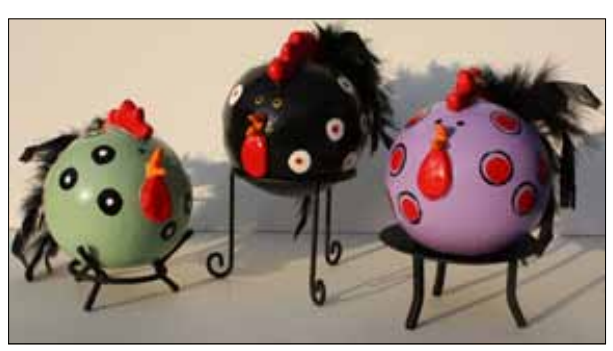
"Gourd Madness Showcase"

The Gourd Madness Showcase is here just in time for autumn celebrations. These wearable, giftable, and decorative gourds are created by several Bay Area gourd artists. Some of the gourds have been painted, while others have been collaged, incised and dyed or embellished with beads and other goodies. You will be amazed of the transformation these humble gourds have made by the hands of their skillful masters. The gourds will be on display from November 13th to the 29th at the FAA's Gallery located at 37659 Niles Blvd. in Fremont. You can meet these very creative artists at a reception held in their honor on Sunday, November 15th from 1:30 to 4:00pm.