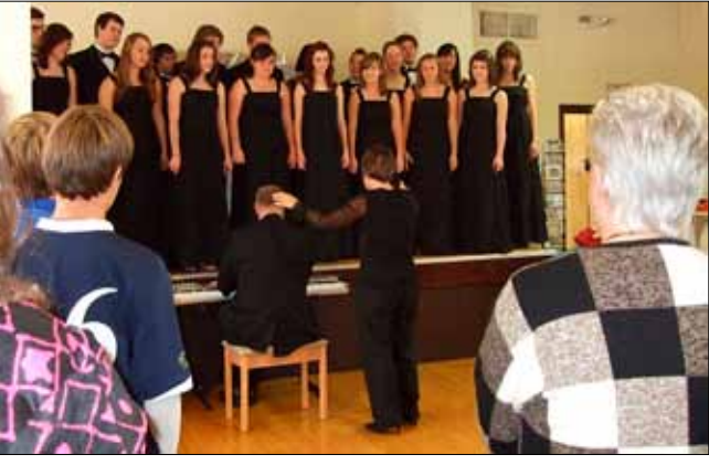
Left: Visitors are looking at mini watercolor paintings. Above: Choir of Berean Christian High School performed at the party