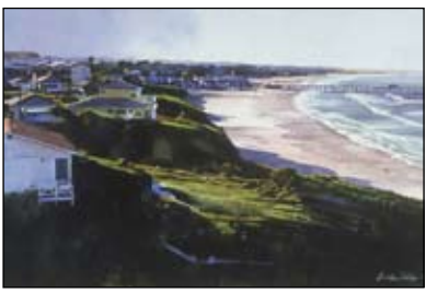
Pismo Beach by Dick Cole

awarded the honor of having his painting, "Pismo Beach" selected as the image for the publicity for the "Century of landscapes: Selections from the California Art Club" at the California Historical Society Galleries. The Galleries are located at 678 Mission Street,