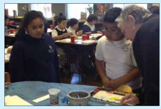
The students watching, seeing.