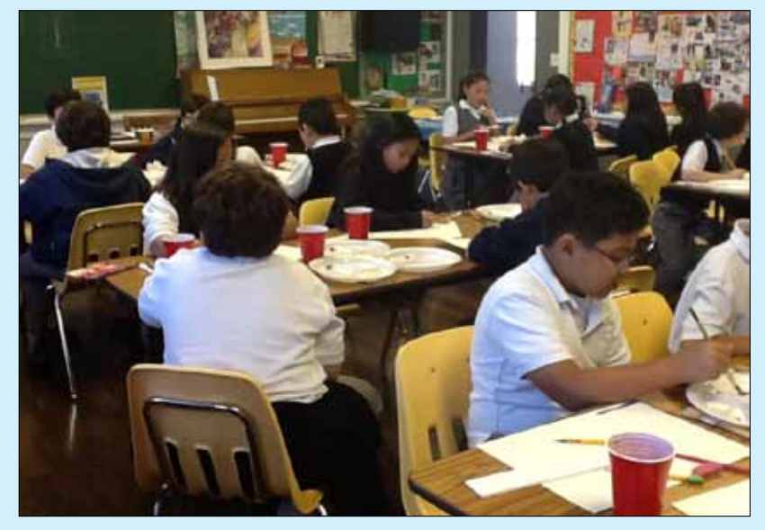
Just 18 of the 32 students who participated in this CWA Outreach.