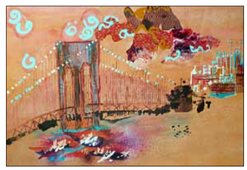
"Big Apple Bridge" by Sue Ashley