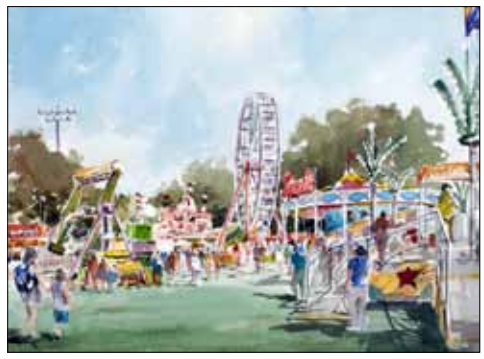
""At The Fair" by Rolando Barrero