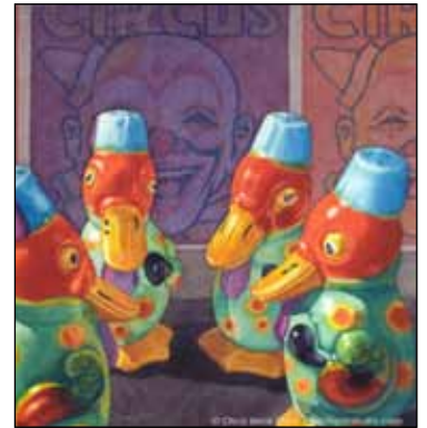
Waiting in the Wings by Chris Beck

Chris Beck is featured in the September issue of The Artist’s Magazine and she also has an online tutorial posted on artistsnetwork.com . Her painting “Waiting in the Wings” was accepted for Splash 14 (coming out in 2013) and also for the 92nd Annual National Watercolor Society Exhibition, which runs from September 29 to December 2, 2012 at the NWS Gallery in San Pedro, CA.