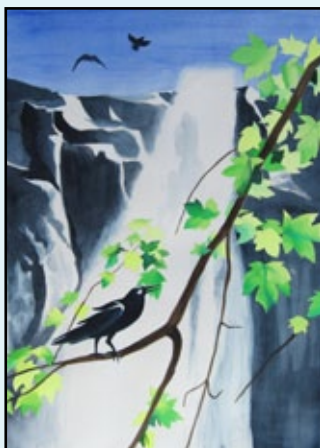
Waterfall by Emi Beifus