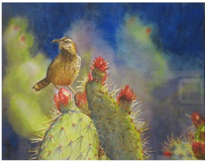
Cactus Wren by Yvonne Newhouse