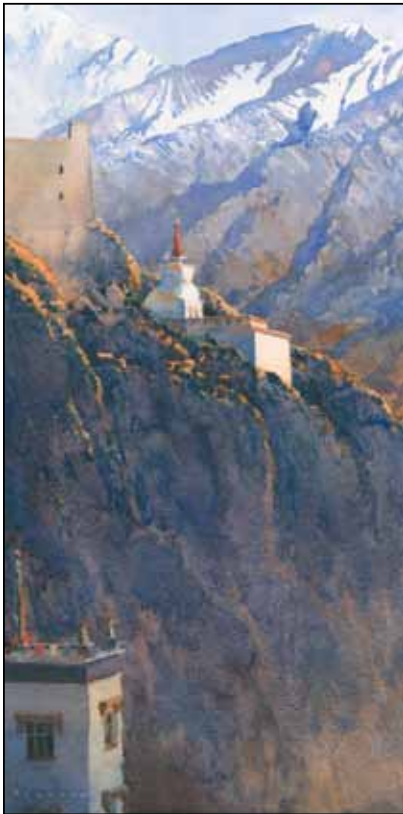
Leh Palace, Ladakh