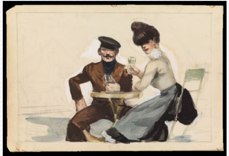
Edward Hopper - Couple Drinking, 1906-07, Watercolor, Pencil and Conté crayon on paper

Dorcas is continually experimenting with new ways to paint and currently is combining organic materials and acrylics. The outcome is a three dimensional construction of unique natural shapes on paper. She loves multiples and uses printed images, repeated images, and 3D constructions. She works with prints and adds to the surfaces using multiple medias. Dorcas may offer some workshops in her garden soon. A final comment from Dorcas was to read Watercolor magazines to find shows.