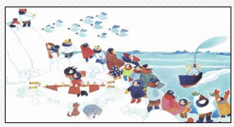
North Star Coming by Rie Munez: Lithograph, 1995

Prendergast's compositions feature the human figure as a flattened design element. The figures move in groups or alone across the surface. The colors are bright and attractive. Some of the reviewers described the effect as rhythmic or tapestry like. I liked Prendergast's work, which reminded me of another watercolor artist.