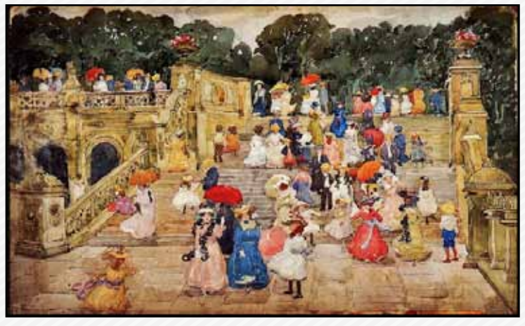
Central Park: The Mall by Maurice Prendergast: Watercolor, 1901

Maurice Brazil Prendergast (1854-1924) is considered an influential, American watercolor artist. A post impressionist, Prendergast worked primarily in watercolor and monotypes. He often painted scenes of beaches or parks that conveyed a sense of place and charm of place.