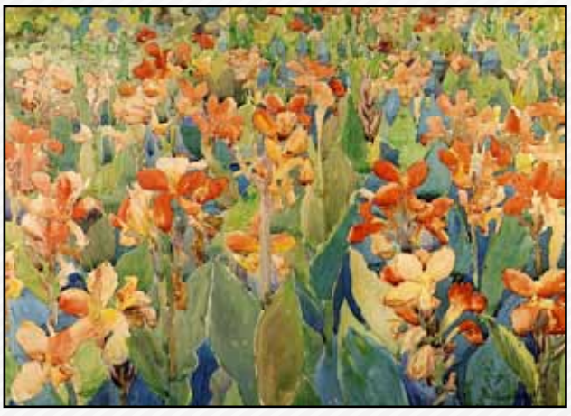
Bed of Flowers by Maurice Prendergast: Watercolor and Pencil, 1899

Prendergast was briefly associated with the Ashcan school of painters when he exhibited at the MacBeth Galleries in 1908. Prendergast supported the concepts of no jury or prizes as a protest against the National Academy of Design, while hoping for more opportunities for independent or innovative artists. He shared that independent perspective with the Ashcan group, but very little else.