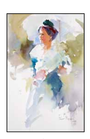
Janet Rogers 4 Days | October 16-19 Expressive Watercolors – Flowers, Faces & Figures CWA Members $495. Non-Members $550

For information, contact our registrar, Sally Noble, at registrar@californiawatercolor.org