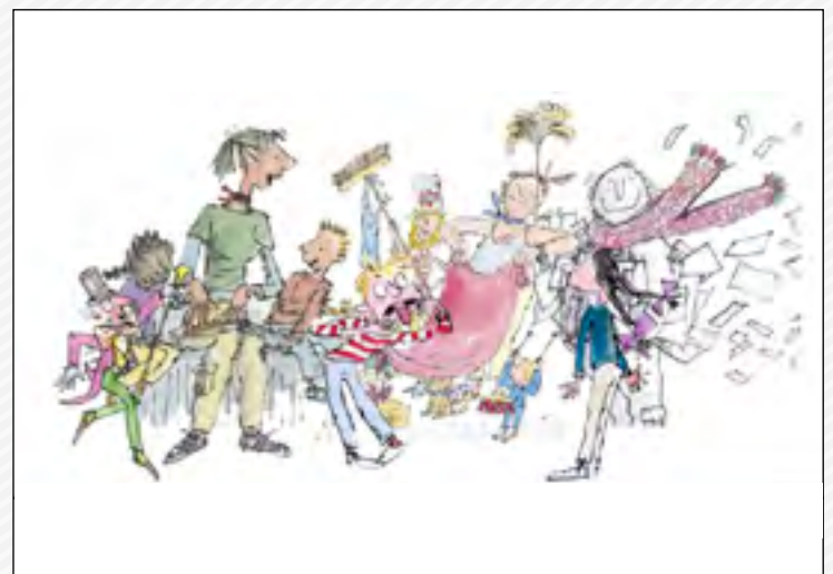
And so many of the pictures do make me wonder what is coming next!