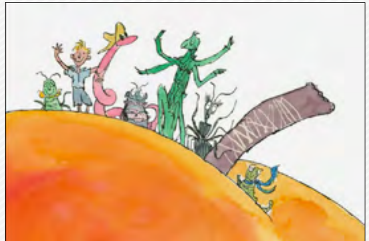
Illustration for James and the Giant Peach by Quentin Blake

Perhaps Blake is most famous for his illustrations of Roald Dahl's books. However, he has illustrated many books for children, showed his work at museums and galleries, and developed giant wall murals.