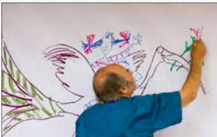
Quentin Blake drawing on a hospital wall in a ward for children

As an illustrator, Quentin uses watercolor to develop stories, which range in size from small, intimate works that I could enjoy in a quiet moment to images that cover walls.