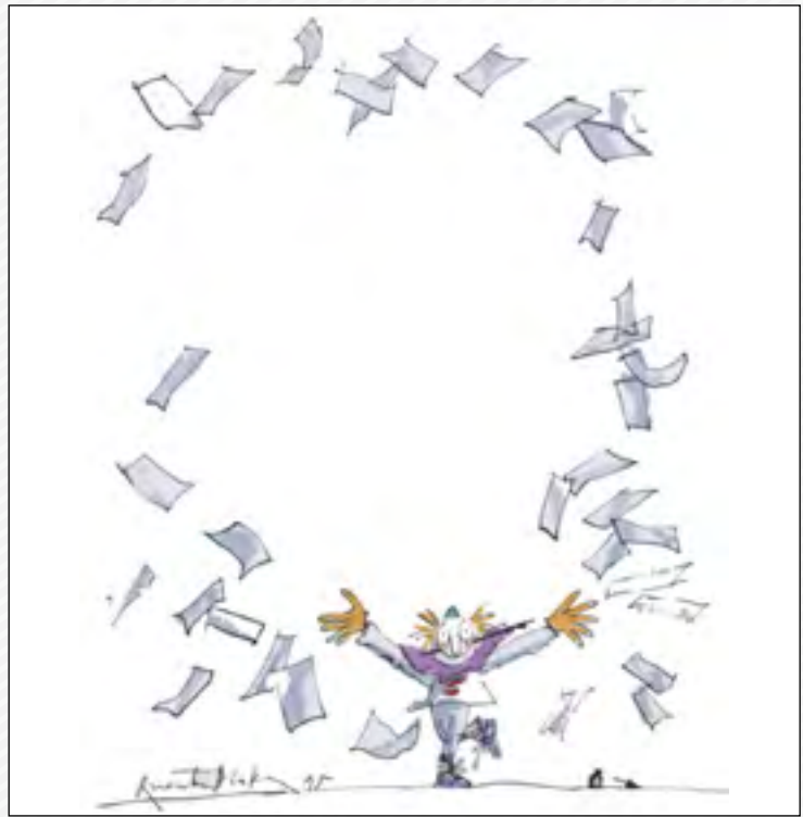
Clown from "Le Petit Theatre de Quentin Blake"

text only: approximately 400 characters, including spaces. $50/month (free to CWA members and non-profit organizations)