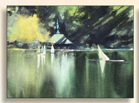
"Through the media of watercolor and my process of painting I find power through brushwork, and subtlety through transparency. Watercolor differs from other media in that there is a performance aspect to it. The fine pieces come out in one sitting and very often like a classic performance, something happens, a fusion of mind and subject, an improvisation that cannot be duplicated" — Gary Tucker