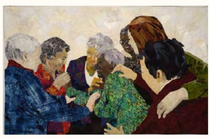
Circle of Friends by Alice Beasley

20% of sales due to LAA Gallery at the end of the session