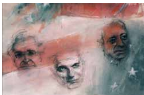
Painting by Alex Powers