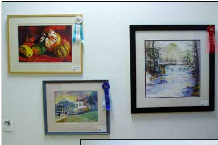
Top: First, Second and Third place winners. Bottom: Honorable Mentions.