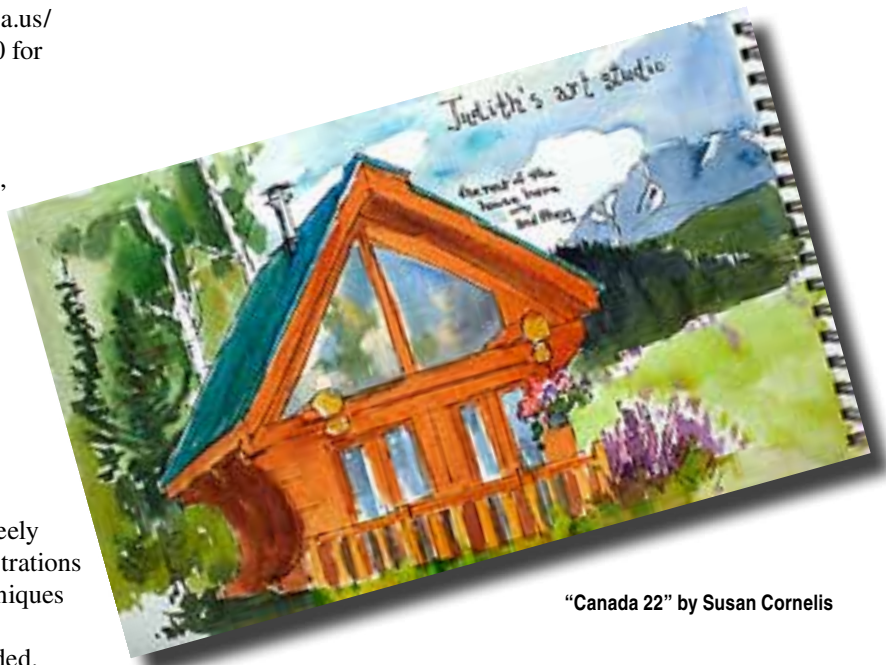
"Canada 22" by Susan Cornelis

Fallbrook School of the Arts has just published its lecture and demo schedule for 2010. A large selection of lectures and demos are free, register as soon as possible as space is limited. Fallbrook also offers a large variety of classes for adults and children (not free). Their fall schedule has just been published as well. Visit them at www.fallbrookschoolofthearts.org/ for more info and to see what tickles your fancy.