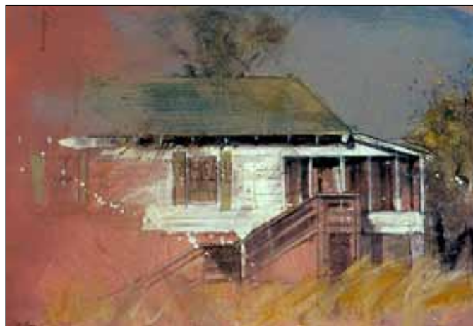
“Abandoned Creek House”