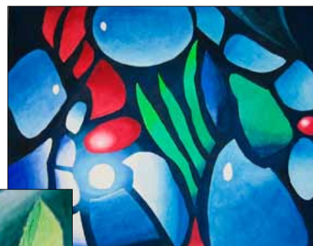
Above, "Abstract 021"

My work is very influenced by Japanese art, especially Manga and Anime. I like to paint things that make people wonder, things that I want to have, fantasy places where I want to be, fantasy creatures whom I want to meet. And also I like to paint cats too.