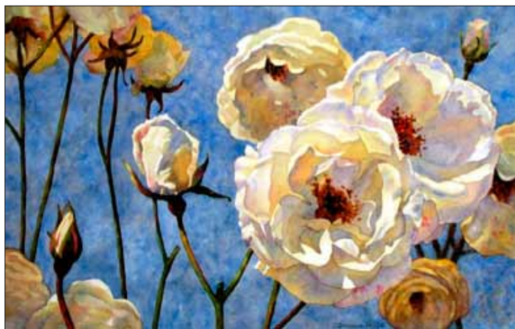
"Blue, Gold & White Roses" by Claire Schroeven Verbiest

Vibrant Watercolors Workshop, Claire Verbiest, KA, NWS, CWA . Fri, Sat, & Sun, March 26-28, 2010, 9:30 to 3:30 pm Walnut Creek, CA. With the help of demos, lectures and lots of hands-on lessons, we will explore together the unique properties of the fluid and transparent medium of watercolor. Topics such as how to render light, work with color, contrast and value, shape, texture and composition will be addressed. We will use a variety of subject matter to produce paintings full of energy and strength. The course is designed for all levels of expertise. There will be lots of time to paint as well as individual help and critiques. The price is $295.00 for three days. Class size is limited, so register early. Call (925) 639-7161 for more information or email pam.howett@sbcglobal.net .