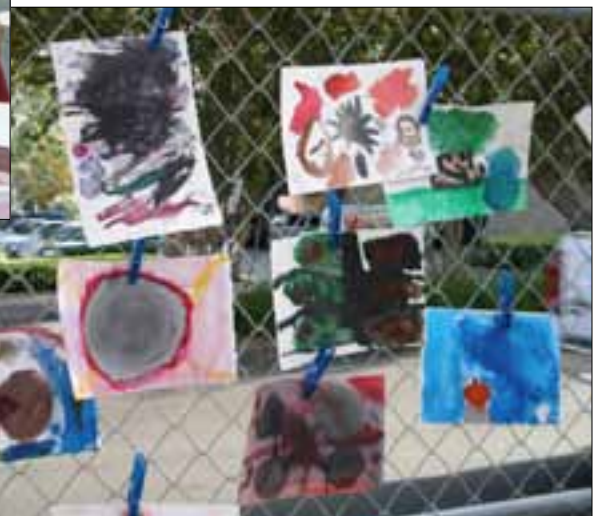
Impromptu gallery/drying rack.