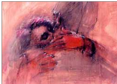
Painting by Alex Powers

The workshop is more about participants’ personal painting style and design, than about any subject matter (image) / models. The workshop will include lectures, individual critiques of previous work and workshop work, as well as group critiques. Intermediate/ advanced level. CWA Members $475; non-members $525.