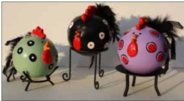
"Gourd Madness Showcase"

Red River Watercolor Society , 17th Annual National Juried Watermedia Exhibition: Entries due: Feb 1, 2010, see www.reddriverws.org for prospectus.