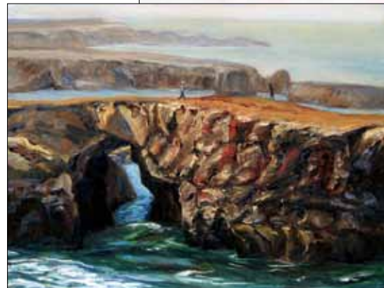
"Cliffs at Point Arena" by Iris Sabre

Also showing will be all the Gallery Concord Members with different styles of watercolor paintings.