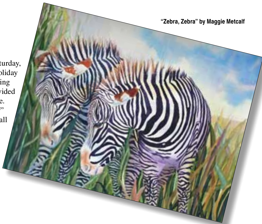
“Zebra, Zebra” by Maggie Metcalf

Gallery Concord is at 1765 Galindo St. Concord, CA (at the corner of Galindo & Clayton). Free parking is available off Clayton Road behind the gallery. Gallery phone is (925) 691-6140. www.galleryconcord.com.