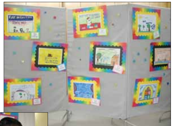
Lead Poisoning Prevention Project