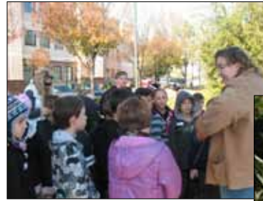
Las Juntas Elementary School

From top to bottom we have the Las Juntas Elementary School field trip to Beaver Park in Martinez. It was at Beaver Park that CWA showed the children how to make watercolor book-marks with rainbows, beaver tails, or whatever they wanted. 60 third graders (2 classes) were given a tour of the location of the beaver dams and lodge in downtown Martinez. After the tour, instruction and practice of Beaver Art took place.