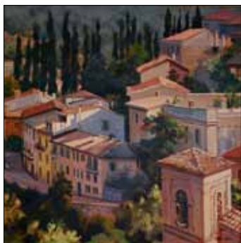
"Arrone, Italy" by Carol Maddox

Jann Pollard, NWS, CWA is returning to the Bay Area to teach two workshops at Filoli Garden in Woodside. Spring Plein-air , Apr 28 - 30, 2010 and Mixed Water Media , May 2 - 5, 2010. Mixed Water Media is a new class full of new techniques to use acrylics and other medias. Full details on Jann's website www.jannpollard.com/workshopfiloli.htm . Or email Jann at jannpollard@mac.com or (704) 910-6422.