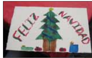
Monument Community Project

Next we have the children of the Monument Community Project . 25 children and adults participated in making watercolor cards. A demo was given on wet on wet as well as dry brush and other methods of painting. Children painted and sang both in Spanish and English as they were working on their cards. Helpers were provided from the parents, and the MCP community. The location was at Palm Terrace on Monument Boulevard, Concord.