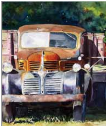
"Old Hay Truck" by Iretta Hunter

January 5 to March 27, 2011. The opening night reception is Friday, January 7th from 6:00 to 8:00 pm. Light refreshments and beverages will be served, and music will be provided by the Dana Street Jazz Trio.