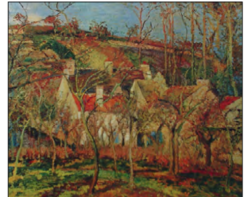
Painting by Camille Pissarro