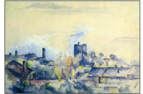
Paintings by Paul Cézanne