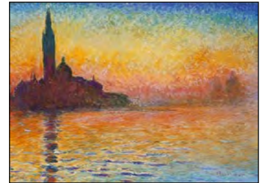
Painting by Claude Monet