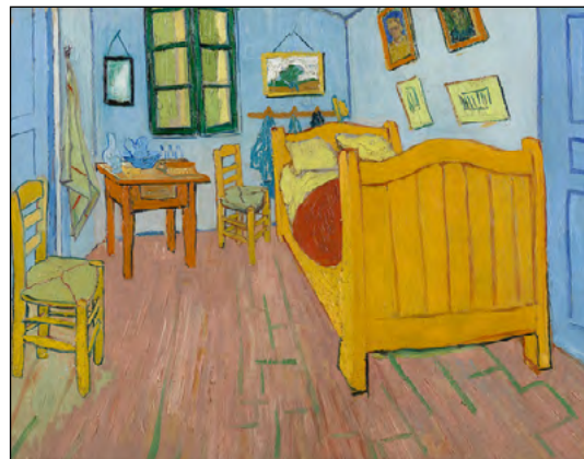
Painting by Vincent van Gogh