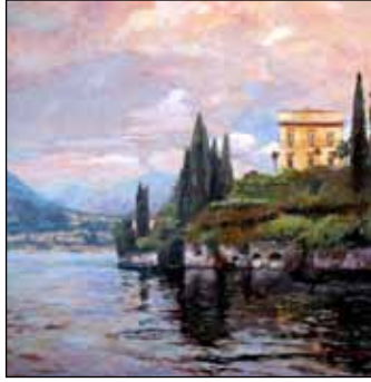
Lake Como Reflection by Jann Pollard

Jann Pollard, NWS, CWA has a feature article in "Watercolor", American Artist magazine, Spring Issue 2012. It is available now either in your subscription or at Barnes and Noble. As an alternate, you can view a web version at: jannpollard.com/watercolorarticle . Two of Pollard's paintings have been purchased for the collection at the new Duke Cancer Center in Durham, North Carolina. Jann will also be teaching a workshop at Filoli in Woodside, California, September 18 - 22, 2012. For more info: www.jannpollard.com , jannpollard@mac.com .