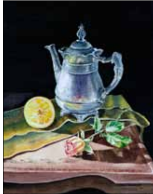
Still Life Light Love Lemon by Irina Sztukowski

Still Life Light Love Lemon by Irina Sztukowski won an American Art Award in 2012 Competition Realism Category. It was judged by 25 famous art galleries across the U.S. and earned 5th place in a tough competition between numerous artists from America, Australia, Austria, Belgium, Canada, China, England, France, Germany, India, Indonesia, Israel, Italy, Japan, Macedonia, Mexico, New Zealand, North Korea, Poland, Romania, South Korea, and Taiwan.