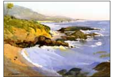
South Laguna View by Larry Cannon

Painting Invitational sponsored by the Laguna Art Museum in October. The photo below is one of his plein air paintings from the 2010 Invitational.