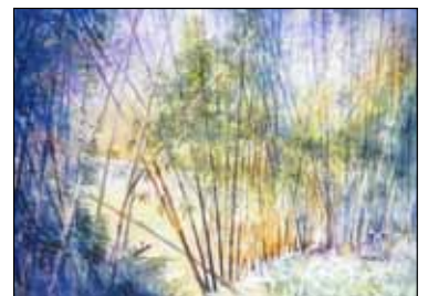
Bamboo Curtain by Alvin Joe

Celebration of the Arts Lake Placid, N.Y. Art Expo October 2012 Angels & Demons On-line exhibition October-November 2012 Red Dot Art Expo Miami, FL December 2012