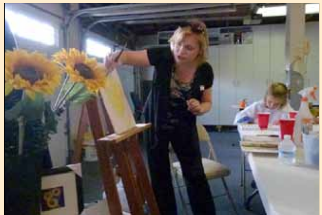
"First you draw a big circle like the sun for your sunflower painting"