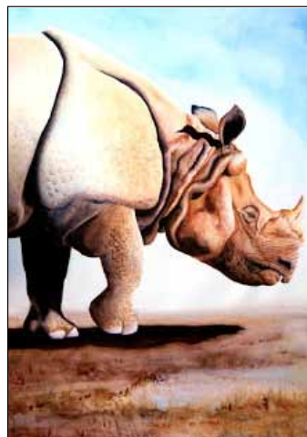
Morning Stroll by Maggie Metcalf

Maggie Metcalf’s painting, “Morning Stroll” was juried into the Triton Museum of Art’s 2012 Statewide Watercolor Competition and Exhibition. The show runs from December 8, 2012- February 3, 2013.