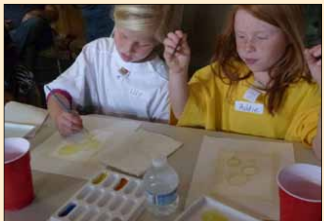
The girls work diligently. The sunflower petals, like rays of the sun, are painted in yellow