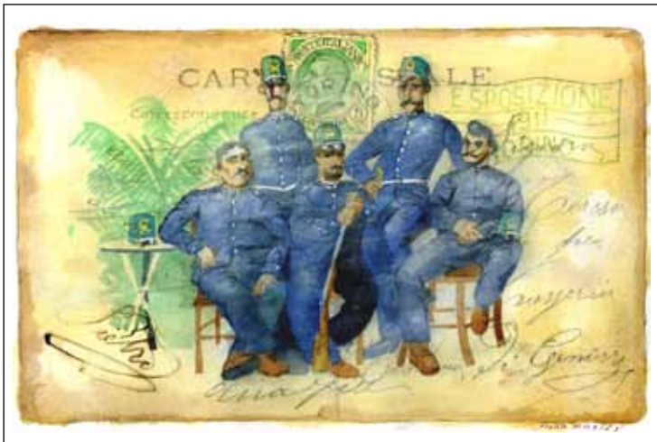
Postcard di Pietro

Copper Skillet Courtyard 811 Ferry Street Martinez, CA. www.fineartirina.com