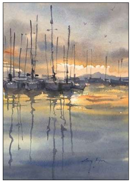
Reflections Golden Hour by Gary Tucker