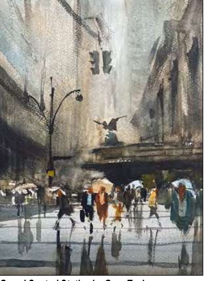
Grand Central Station by Gary Tucker