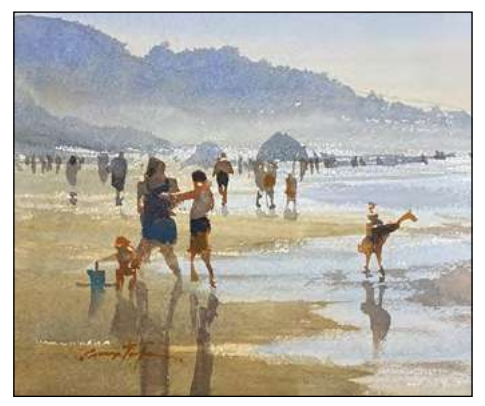
Summer Days by Gary Tucker