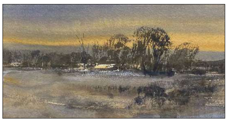
Slumber by Gary Tucker