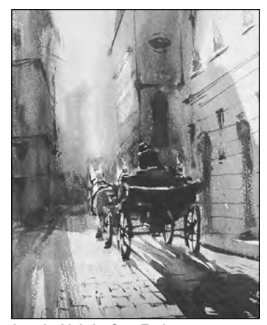
Into the Light by Gary Tucker