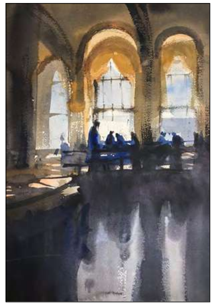
Cafe Central - Vienna by Gary Tucker