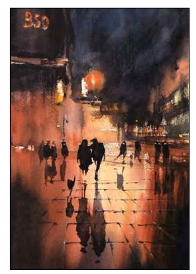
City Lights by Gary Tucker