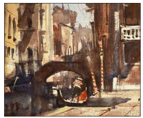
Terra Cotta by Gary Tucker