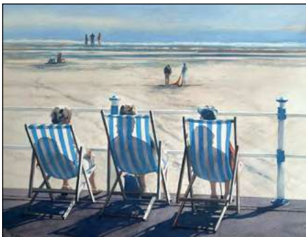
Beach Front Property by Ruth Miller