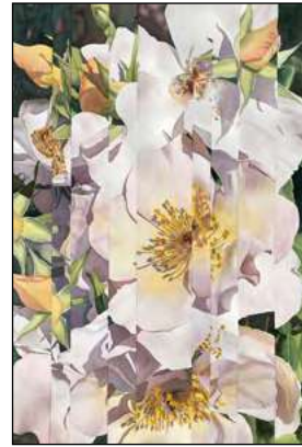
Sun Blossoms by Iretta Hunter