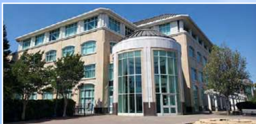
John O'Lague Galleria at Hayward City Hall 777 B St, Hayward City Hall, Hayward, CA 94541 www.haywardartscouncil.org

Log in to the Members home page at www.californiawatercolor.org , choose Shows/Exhibitions , then Member Shows and choose My Vision . Confirm your information, add your painting details and upload your images. Entry Fee is $25 for one or two images, $35 for three images.