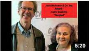
CWA 50th National Art Show at the Harrington Gallery