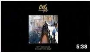
CWA 50th National Show 2020