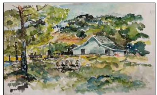
Watercolor by Chuck Dorsett