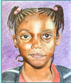
Portrait of Terah