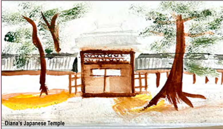
Diana's Japanese Temple