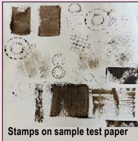
Stamps on sample test paper