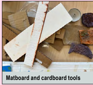
Matboard and cardboard tools