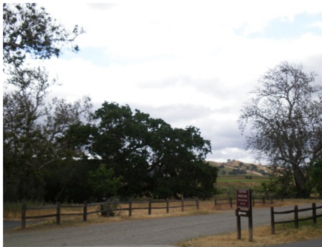
Arroyo entrance (more wooded)

Sycamore Grove Park 5211 Arroyo Rd. (Veteran's Entrance) Livermore, CA, 94550 Friday, Oct. 2, 2015