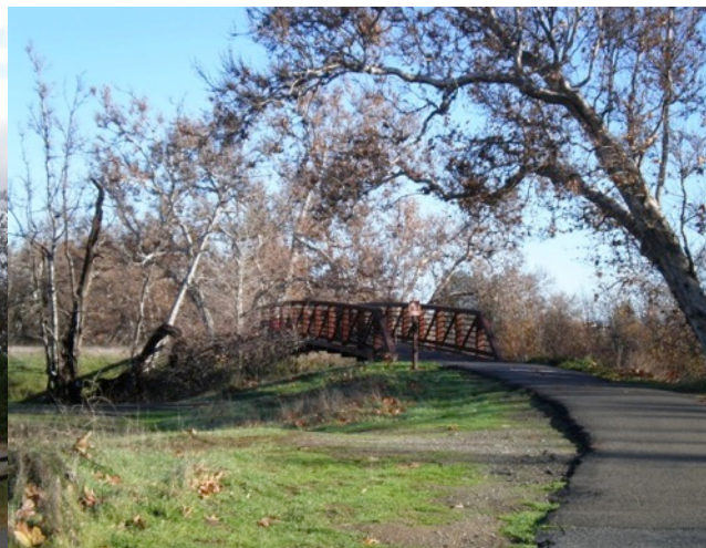
Wetmore entrance (more open)

Join CWA at one of the tri-valley's nicest parks. Surrounded by vineyards and olive groves, Sycamore Grove boasts 775 acres of parkland. Two entrances to the park each have many scenic items to paint, such as bridges, arroyos, trees, and wildlife. A 2.5-mile paved walking/bike path connects the two entrances, and there are many off-path trails for more adventurous painters. If you want to explore the park's interior, a trail bike makes that a little easier. Note: parking is $5 per car per day; one ticket is good at both entrances. Also, at both entrances are bathrooms.